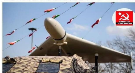
Iranian kamikaze drones used in the latest attacks on Ukrainian cities are filled with European components, according to a secret document sent by Kyiv to its western allies in which it appeals for long-range missiles to attack production sites in Russia, Iran and Syria.